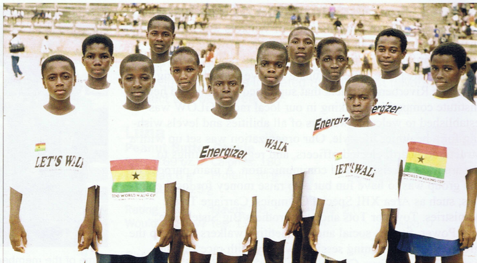
Ghana's top young walkers after a competition at the Visco walking academy.

During my first visit to Ghana in May of 2000 I was scheduled to give a number of clinics across the country, but I spent a great deal of time doing television, radio and newspaper interviews instead of working with walkers as much as possible. I questioned this apparent waste of our precious little time together. Wouldn't my time in country be better spent working with the athletes to get